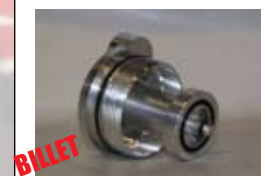
CBM BILLET OIL FILTER ADAPTER

LS-1/LS-2/LS-6, LS3/L-92, LS-7 stock 4.100" stroke.