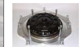
CHEVROLET LS CLUTCH KIT

Custom alternator bracket for LS style engines. Accepts factory and most aftermarket alternators.