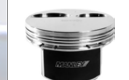
MANLEY PLATINUM SERIES PISTONS

F-body style, bolts in place of the factory unit.