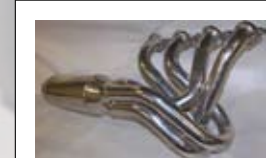
GIBSON LS STYLE HEADER & MUFFLER

Used with a factory GM style sender for oil pressure.