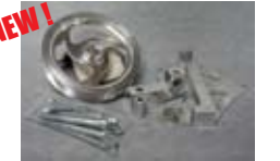
CBM BILLET POWER STEERING BRACKET KIT

This kit is designed for the 2.2L L61 and the 2.4L LE5 Ecotec models. Runs with the factory GM alternator.