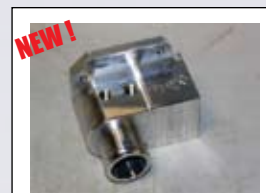
CBM BILLET ECOTEC WATER NECK BLOCK