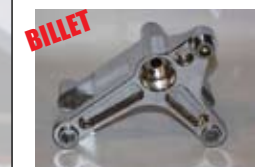
CBM BILLET ALTERNATOR BRACKET

Custom alternator bracket for LS style engines. Accepts factory and most aftermarket alternators.