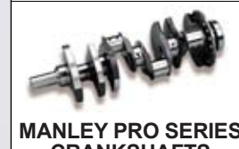
MANLEY PRO SERIES CRANKSHAFTS

GM 2.2L Ecotec with a std. or 0.010" bore. Set of 4 pistons, new rings and wrist pins.