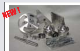
CBM BILLET A/C BRACKET KIT