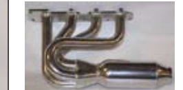
CBM ECOTEC HEADER w/ MUFFLER

Complete LS style (LS1, LS2, LS3, LS6, LS7, LS9, LSX) clutch, pressure plate, flywheel, adapter plate.