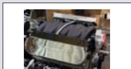
CBM COIL COVER KIT C6 Corvette LS7 coil cover kit chrome plated.