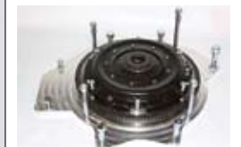
ECOTEC ADAPTER AND CLUTCH KIT

Complete Ecotec clutch, pressure plate, flywheel, adapter plate and all necessary hardware.