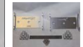
CBM LS STYLE COIL RELOCATION BRACKETS

Custom oil filter adapter for all Ecotec style engines (2.0L, 2.2L, 2.4L, L61, LE5,) 10 AN.