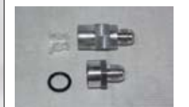
CBM ECOTEC FUEL RAIL ADAPTERS

Complete Ecotec clutch, pressure plate, flywheel, adapter plate and all necessary hardware.