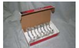
MANLEY RACE SERIES VALVES LS1/LS2 (LS6 HEAD).

This kit is designed for the 2.2L L61 and the 2.4L LE5 Ecotec models. Runs with the factory GM alternator.