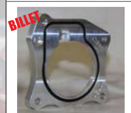
CBM BILLET INTAKE ADAPTER

Specifically designed for the Chevrolet LS1/LS6 4.100 stroke 58 tooth.