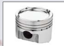
JE/SRP ECOTEC L61 FORGED PISTONS

Designed to fit most rear engine sand cars. Ceramic coated.