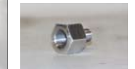
CBM BILLET ECOTEC 2.2L 2.4L OIL PRESSURE ADAPTER

Used with a factory GM style sender for oil pressure.